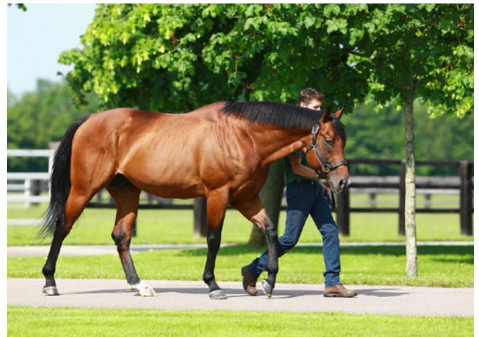
Siyouni, the sire of the Irish Guineas winners Paddington and Tahiya in 2023.

As previously mentioned, Gleneagles served up a hat-trick of successes in the Italian Classics. His daughter Shavasana triumphed in both the Gr.3 Premio Regina Elena (Italian 1,000 Guineas) and the Gr.2 Oaks d'Italia, while son Vero Atleta ensured a Guineas double for the sire in the Gr.3 Premio Parioli.