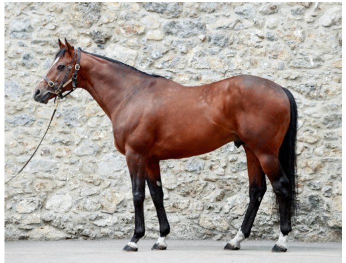
Kessaar (Kodiac) will stand at Allevamenti della Berardenga in Italy this year for €5,000.

Contact: Coolmore Stud Tel: +353-52-6131298. Castlehyde Stud Tel: +353-25-31966. E-mail: sales@coolmore.ie Website: www.coolmore.com