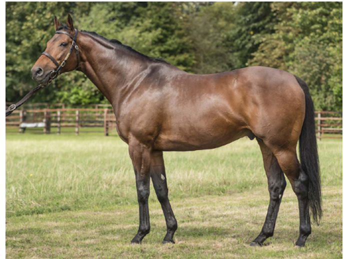
Sea The Moon enjoyed a fine 2023, siring the winners of the Deutsches Derby and the Preis der Diana.

history, Auguste Rodin being the most recent of those. The importance of this race with regards to Epsom is unquestionable and, since the turn of the century, the race has been won by five future Derby winners ( High Chaparral, Motivator, Authorized, Camelot and Auguste Rodin ).