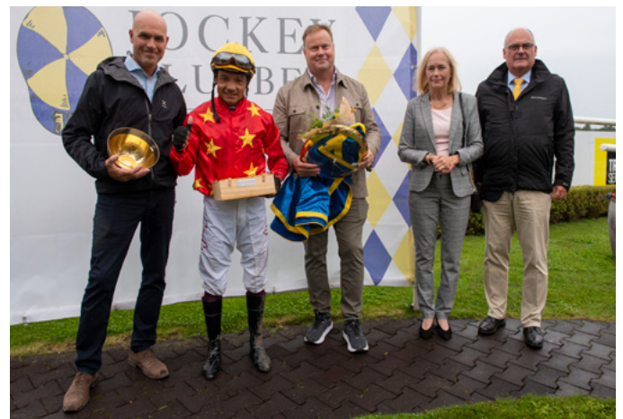
Connections of American Zodiac (Juniper Tree) after success in the Swedish Oaks.