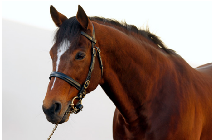
Gleneagles sired a pair of Italian Guineas winners, as well as the Oaks d'Italia winner, in 2023.

More drastic examples include the respective British and Irish Oaks winners Soul Sister and Savethelastdance , who both