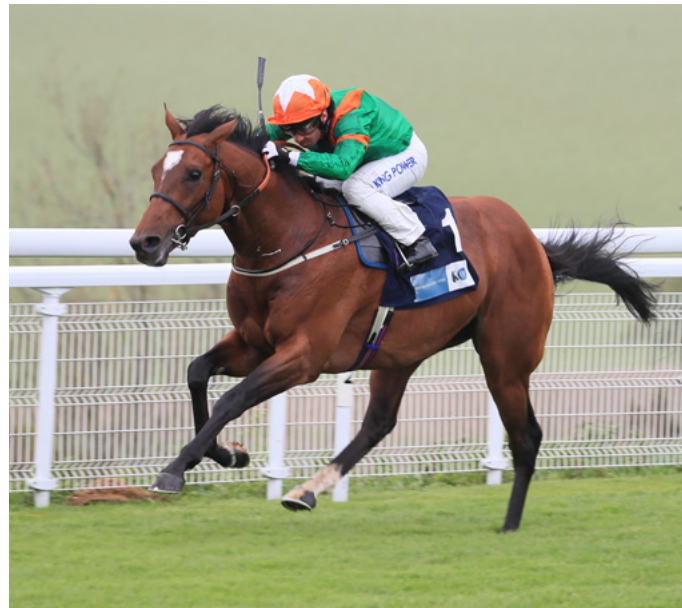
Group winner and Classic runner-up Lone Eagle (Galileo) will stand at Haras du Mazet in France this year.

Lone Eagle was injured on his next outing in the Gr.1 King George VI and Queen Elizabeth Stakes and did not run again at