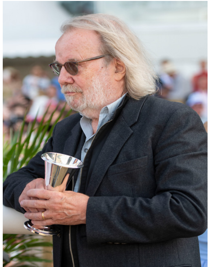
Benny Andersson celebrates success in the Swedish Derby at Jägersro.